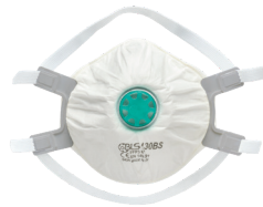
Adjustable elastics with valve BLS 130 BS