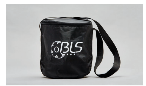
C41 - Washable bag with shoulder belt.