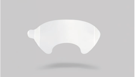
K19 – Acetate visor cover.