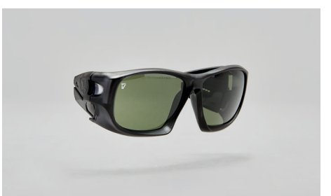
C22 - Frame for prescription lenses.