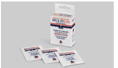
Q409 - Multi-purpose disinfectant wipes.