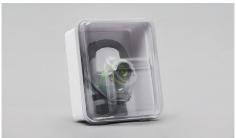
C90 – Wall mounted container.